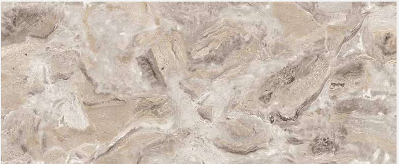
Cipollino Bianco 1881K-35