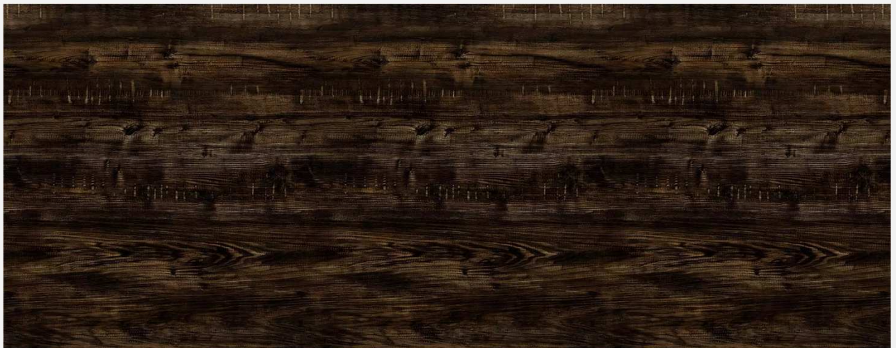
Scorched Chestnut Y0487K-12