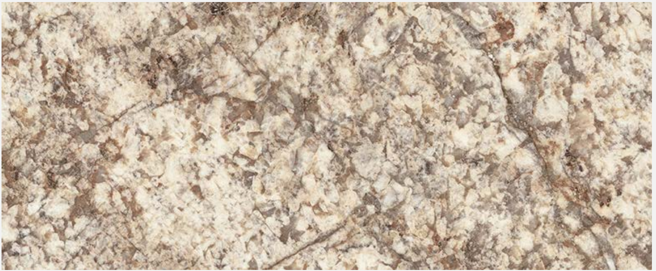
Bianco Romano 1872-35