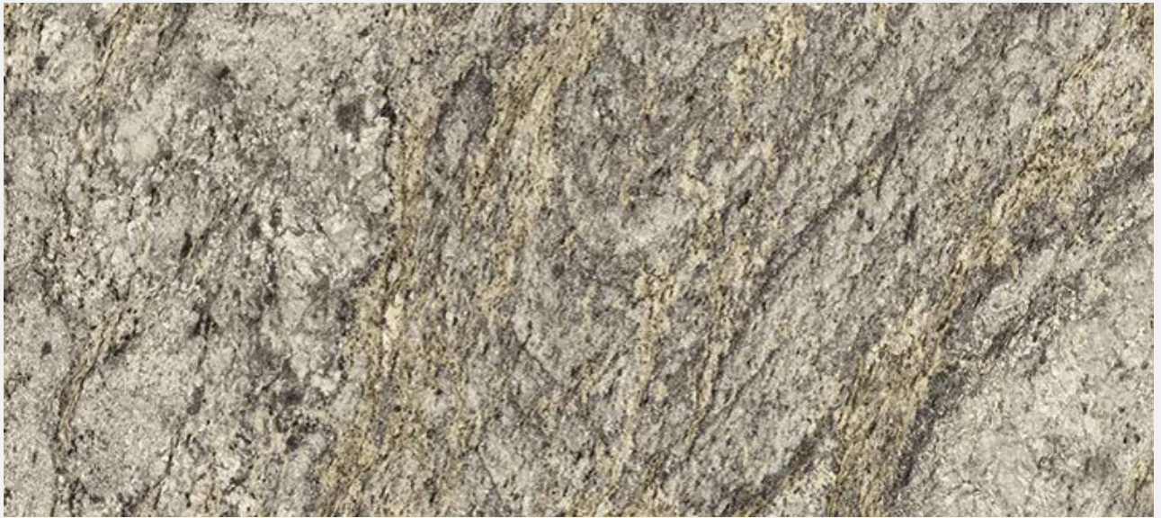
Granito Amarelo 1878K-35