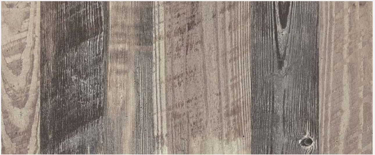
Antique Marula Pine 8216K-28