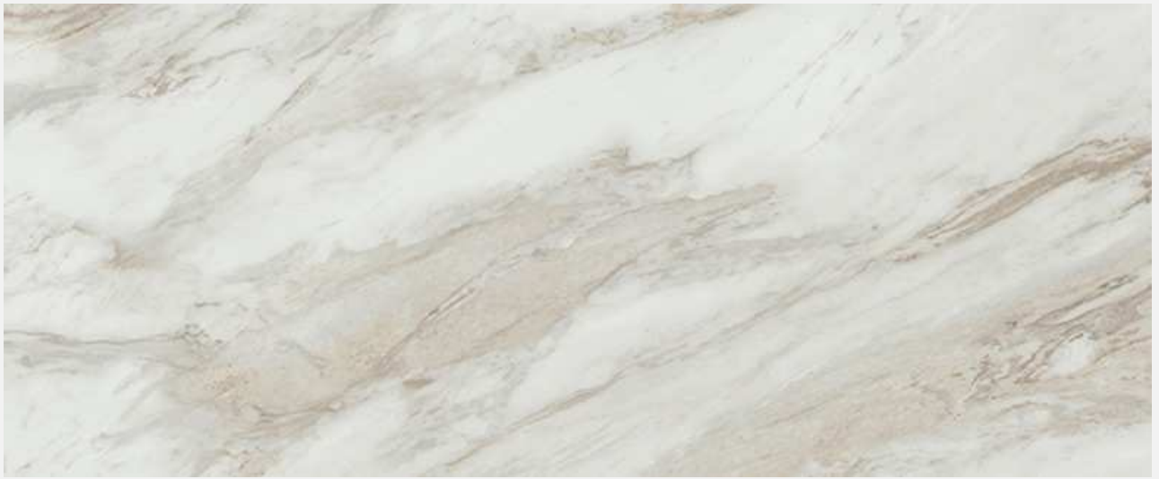
Drama Marble 5010K-21