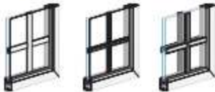
Flat Profile | Contour Profile | SDL

Choose from flat or contour profile grilles—between-the-glass for easy cleaning or Simulated Divided Lights (SDLs) for a more traditional look.